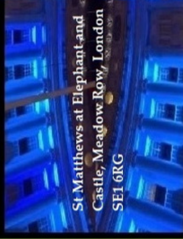
St Matthews at Elephant and Castle, Meadow Row, London SE1 6RG

Book Your Tickets Slots and Stalls and Apply to Volunteer thehumanion.com