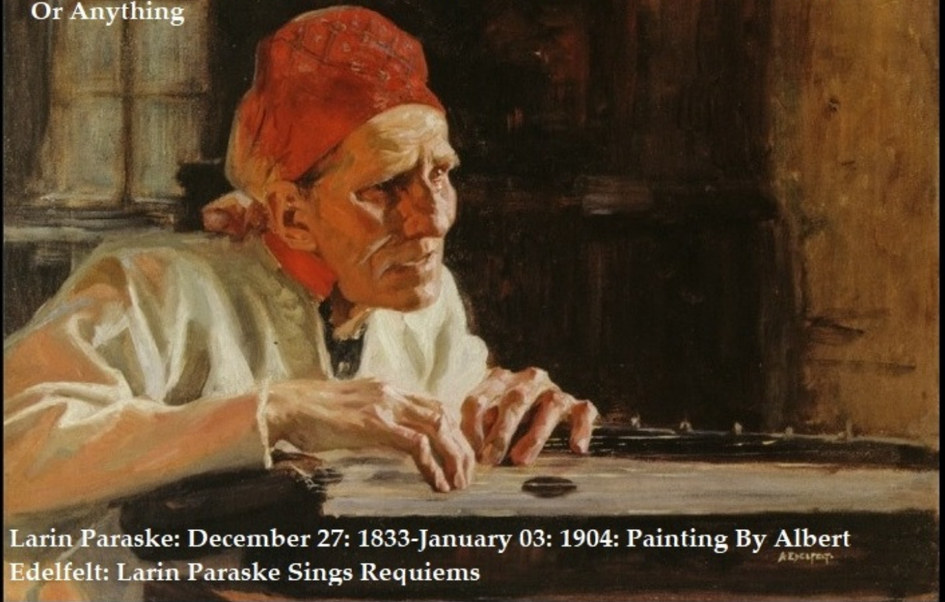
Larin Paraske: December 27: 1833-January 03: 1904: Painting By Albert Edelfelt: Larin Paraske Sings Requiems

Humanics: The Larin Paraske Maxim Or Oath: Do No Harm to Anyone Or Anything